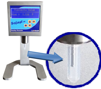
Small sample tube 2 ml