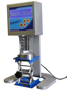
Lab jack and agitator